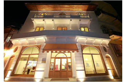
Current photo of the facade of the Villa Palma Boutique Hotel

The solution was to create a masterpiece of hotel luxury in the middle of the most classic area of Panama City, The Villa Palma Boutique Hotel.