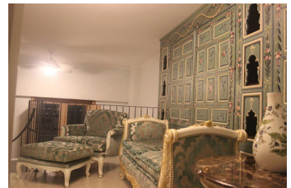
Current photo of the interior of "The Turquoise Suite" of the Villa Palma Boutique Hotel

Each room tells a different story, from french neoclassicism to architectural eclecticism that mixes styles such as gothic, romanesque and oriental in the same space. The rooms and public spaces of this hotel, unique in Latin America, are a very special invitation to stop to enjoy the details.