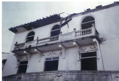
Photo of the building where the Hotel Villa Palma is located, in 1994, prior to its reconstruction.